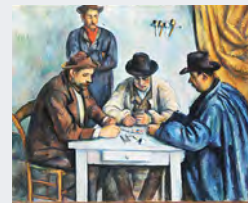
Phileio, Philia (greek) Love between Friends