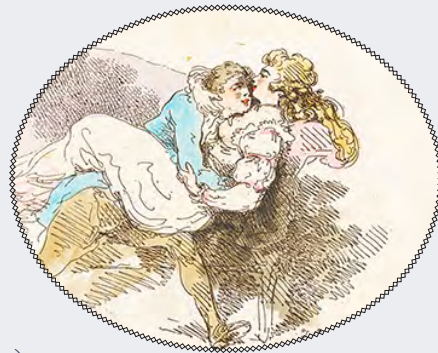
Eros (greek) Sexual and/or Romatic Desire/Love