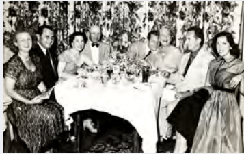
Xenia (greek) Guest-Friendship Love