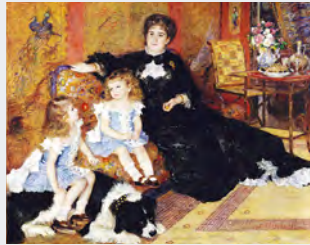
Storge (greek) Familial Love