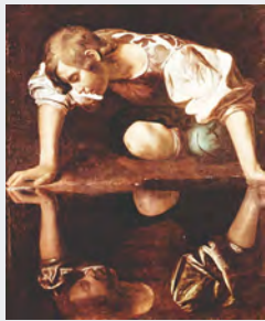
Philautia (greek) Self-Love Self-Compassion Self-Obsessed Love