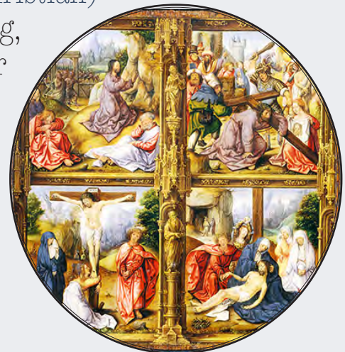
The Passion of Christ

Illustrations / Public Domains: - Faith / Pikist